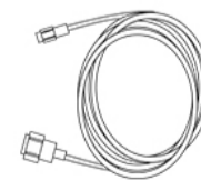
12m outdoor Cable